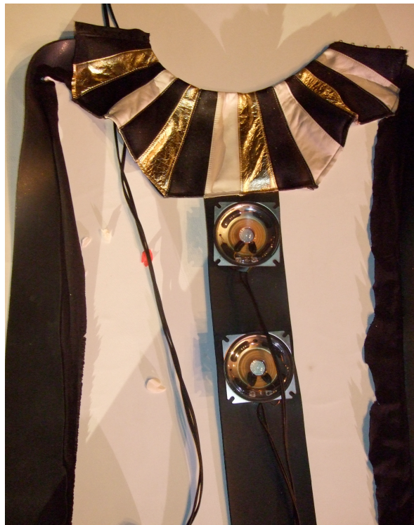
Fig. 6. Neoprene and leather collar feature (discarded appendage) with square speakers emitting tiny voices, final scene in UKIYO , Sadler's Wells 2010

own sound and resultant choreography, as they are dropped furiously to the floor in frustration, and the amputated vestigial collar provides an eerie object presence in itself, as it remains long after the performer has gone, with tiny voices, just traces, still emitting from the transparent membranes of its two golden speakers (Fig. 6).